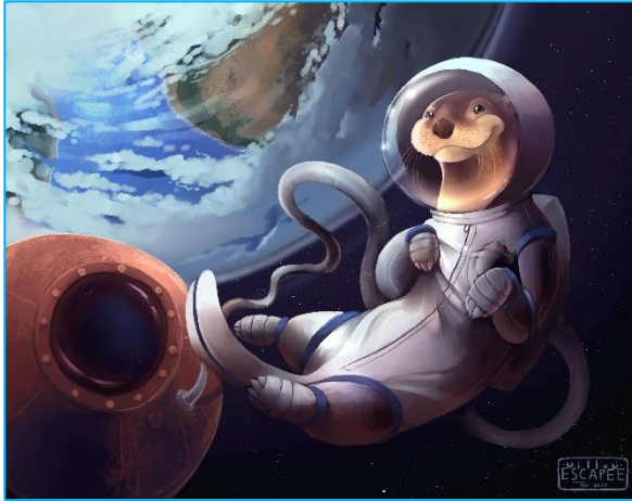
Digitally painted full-body character with a complex background

Digital paintings are pieces with no line art, bold brush strokes, and more texture than a lined piece. The colors of the character are affected by environment and lighting. The process for digital painting is a lot less constrained than digital drawing, but it requires more