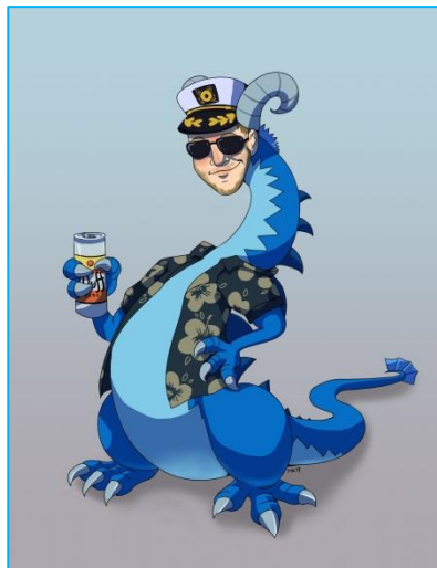
Modified Cel Shading