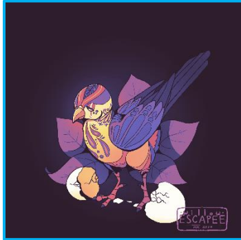
Experimental single character digital drawing, cel shaded

It is not uncommon for me to try new techniques and want to get better at them. Experimental styles run with the same pricing scheme as Digital Drawings, with a slight discount. This is due to the experimental nature of the piece which may skew desired colors, values, or textures, or may limit the background or composition. Typically, these will also be smaller scale pieces