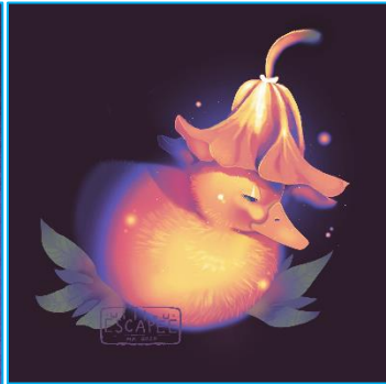
Experimental complex single character lineless digital painting