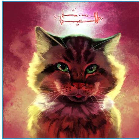
Digitally painted portrait with a simple background

The following table gives a price estimate for a digital painting. These prices are not final and will be adjusted on a case-by-case basis.