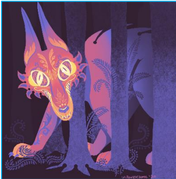
Experimental complex single character lineless digital drawing, modified cel shaded